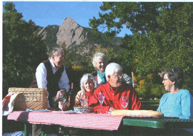
Members planning Boulder's Silver Sage Village enjoy a picnic.

Developers and gerontologists expect that both types of cohousing will grow in popularity as the aging Woodstock generation seeks a way to recreate the community-like experiences of their youth. Many experts also consider cohousing a way for seniors to avoid isolation and to find the help they need without turning to assisted-living or nursing-home care.